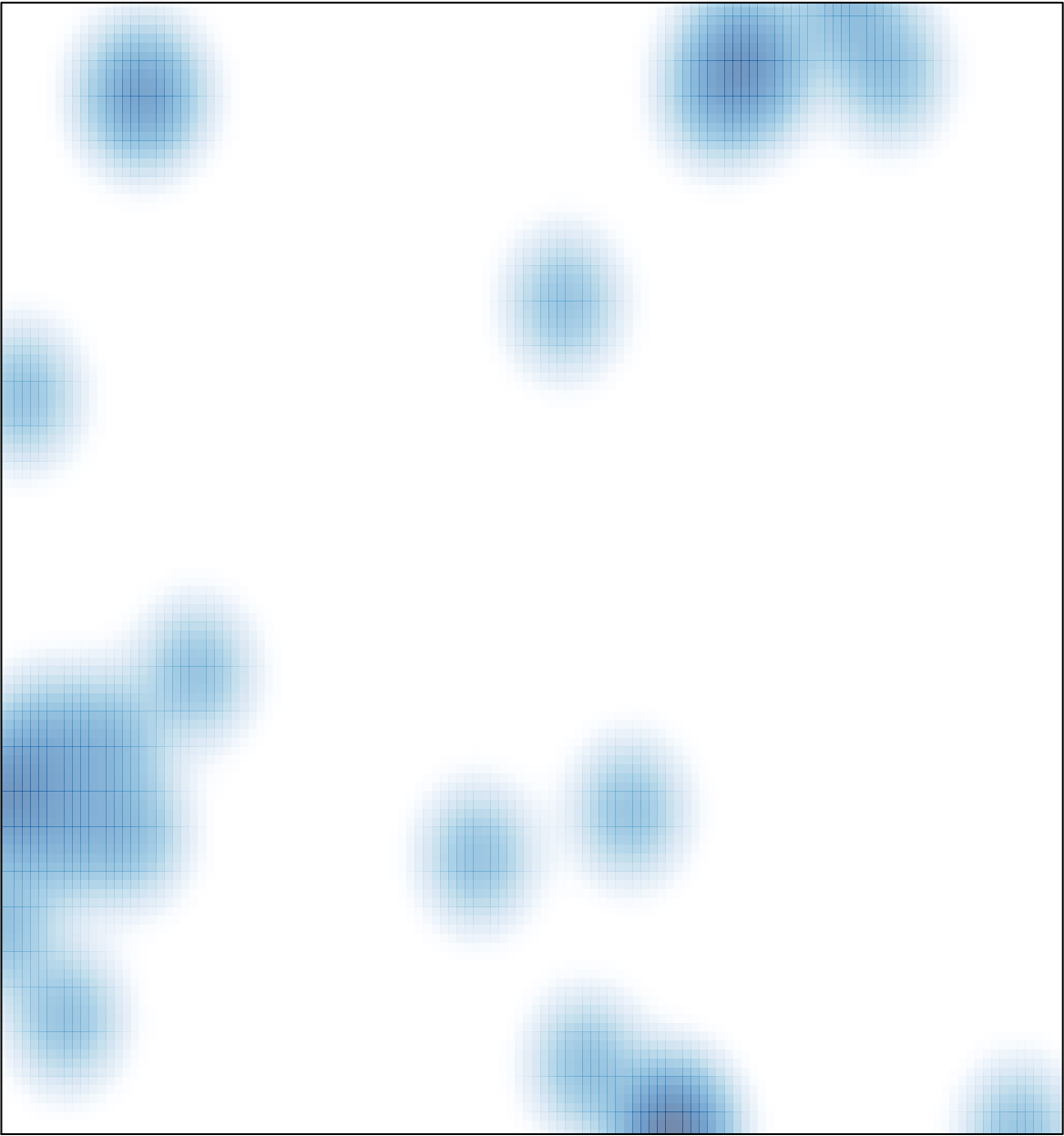
# features = 25 , max = 3